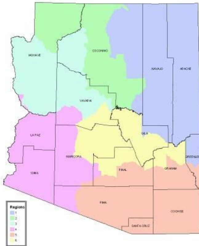
Arizona Game and Fish Department Regions

Region 1 2878 E. White Mountain Blvd. Pinetop, AZ 85935 (928) 367-4281